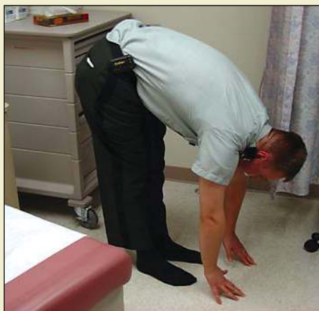
1 Point —Forward flexion with the hands flat on floor and knees extended

Figure 4. Maneuvers used to calculate the Beighton score. Four of the five maneuvers are each done on the right and left sides, and 1 point is awarded for each positive result. The photographs show how to perform each maneuver but do not necessarily represent a positive result. The highest possible score is 9. A score of 4 or higher meets the Brighton major criteria for hypermobility. (Note: Readers should not be confused by the similarity of these two names. “Beighton” is the correct spelling of the name of the score, and “Brighton,” the correct spelling of the name of the criteria.)