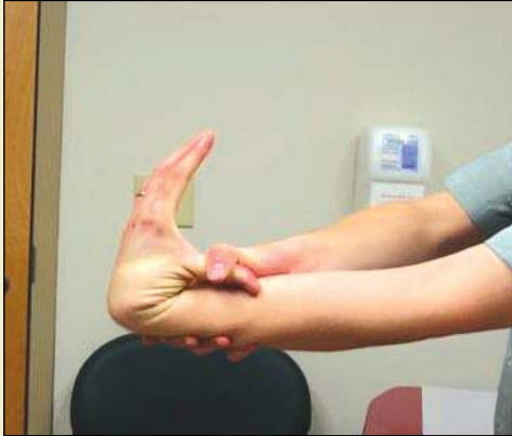
1 Point Each Side —Apposition of the thumb to the flexor aspect of the forearm