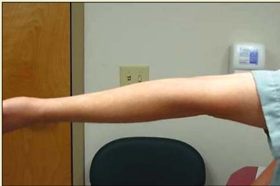
1 Point Each Side —Hyperextension of the elbow beyond 90 degrees (neutral)