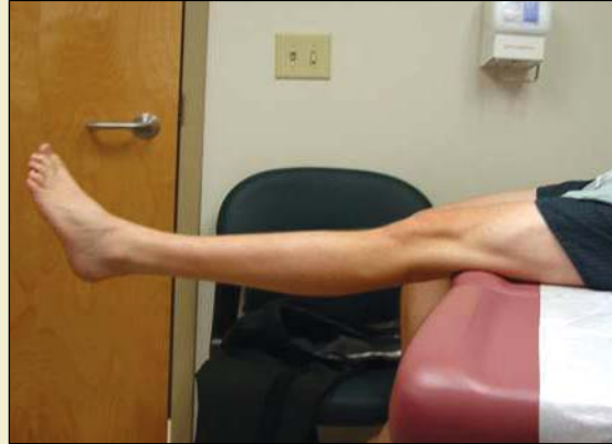
1 Point Each Side —Hyperextension of the knee beyond 90 degrees (neutral)